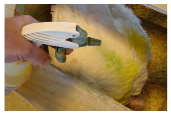
Figure 2. Spray broody hens with a colour marker for easy identification

It is best to remove all marked females found on the nest as this system is based on nesting behaviour and as such gives an early indication of broodiness. Each day a different colour can be used, although the disadvantage of this is that the females can become multi-coloured, making correct identification of the colour for the day difficult. It is, therefore, important to use colours that will not persist too long, such as dilute food colourants or children's water-based paints.